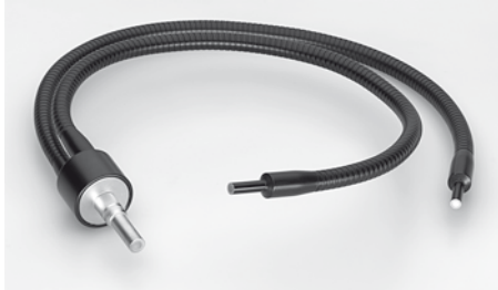
Gooseneck light guide bifurcated