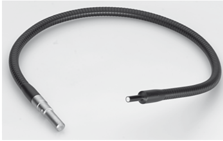
Gooseneck light guide