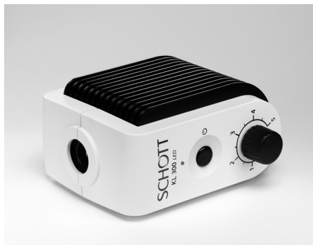
KL 300 LED