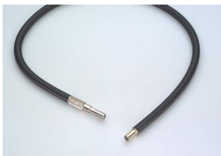
Flexible light guide single