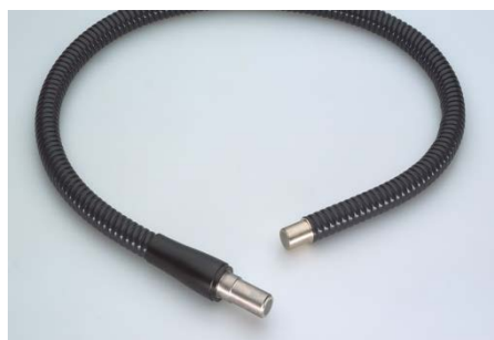
Flexible light guide for KL 2500 LCD